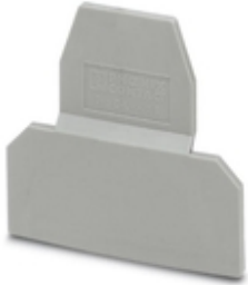
End cover, length: 56 mm, width: 2.5 mm, height: 52 mm, color: gray

Please be informed that the data shown in this PDF Document is generated from our Online Catalog. Please find the complete data in the user's documentation. Our General Terms of Use for Downloads are valid ( http://phoenixcontact.com/download )